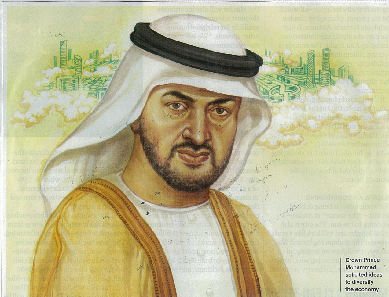
Crown Prince Mohammed solicited ideas to diversify the economy