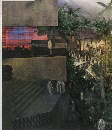
Artist's rendering of the planned city of Masdar

dar officials on Dec. 9 to discuss the possibility of working with the fund. Riverstone works closely with buyout giant Carlyle Group, which is 7.5% owned by Mubadala Development, the government investment arm and Masdar's parent.